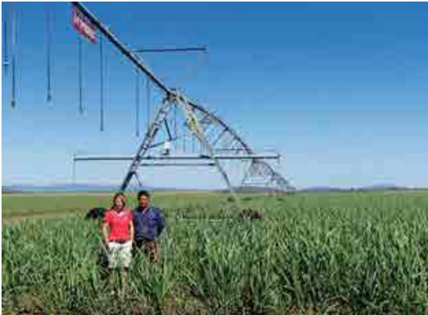
Along with other members of the Mulgrave Area Farm Integrated Action (MAFIA) group, the Hesp's conducted a four year sugar cane crop cycle trial comparing a lateral/pivot system (used on their own farmland) to both furrow and drip irrigation systems on a nearby property.

Hesp Farms had been losing an average of 513 to 627 millimeters (20 to 25 in.) of water per yielding season with flood irrigation; this represents between 19 to 23 percent of the total water applied. And water costs were almost twice as much.