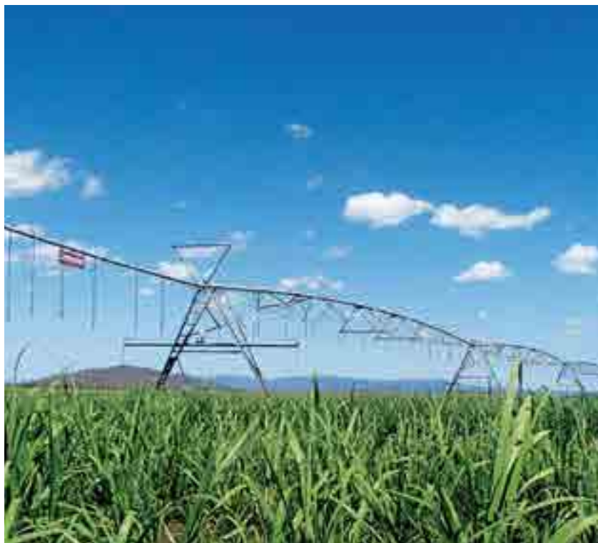
The Burdekin region of North Queensland is one of Australia's largest and most productive sugar cane growing areas.

Green cane harvesting and trash blanketing are being trialed in the Burdekin region to help minimize any pesticide concerns which may threaten the Great Barrier Reef, the rising ground water levels, and the high use of water.