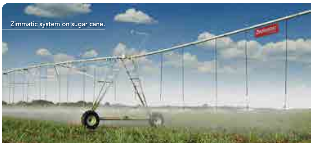
Zimmatic system on sugar cane.