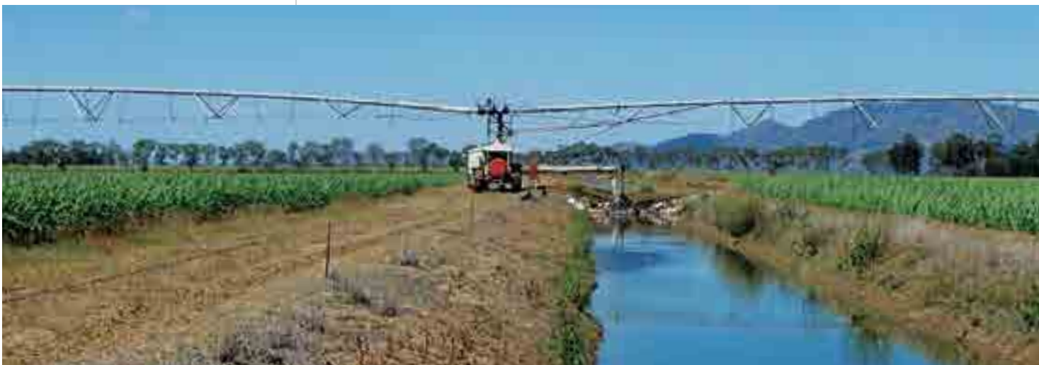
Zimmatic by Lindsay ditch-fed lateral irrigation system on the Hesp farm.