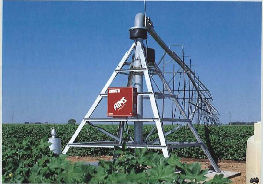
AIMS panels help cotton growers program center pivots to apply precise amounts of water at very crucial points during crop development.

Drops help LEPA systems keep up to 98 percent of the water on the ground and crop, greatly reducing loss to wind and evaporation.